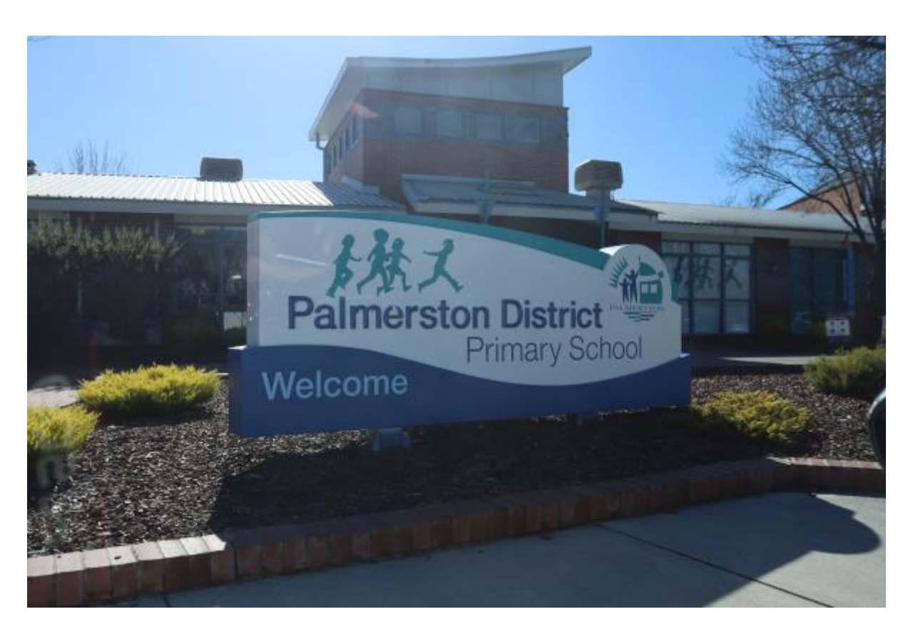
Palmerston District Primary School Newsletter Issue 7